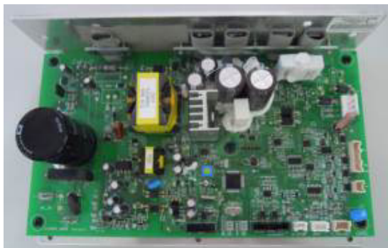
LCB without the transfer board (Part number # 1000203336 )